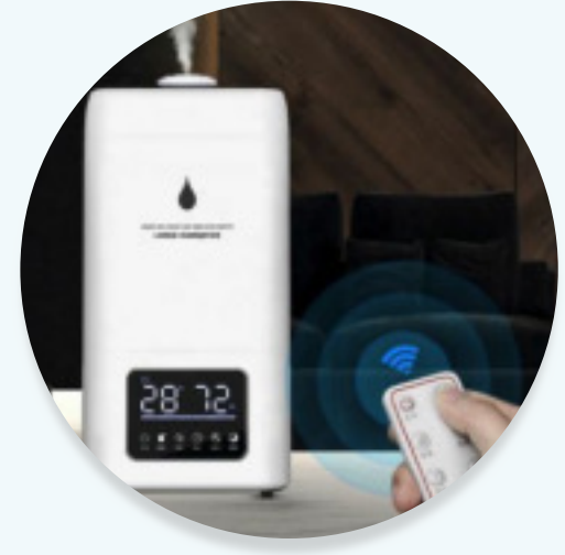
AQUAHOME 24 Litres

+5 liters Aquasine misting Dilution from 25% to 50%