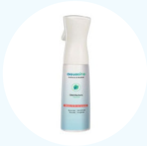
AQUASINE Surfaces & Equipment