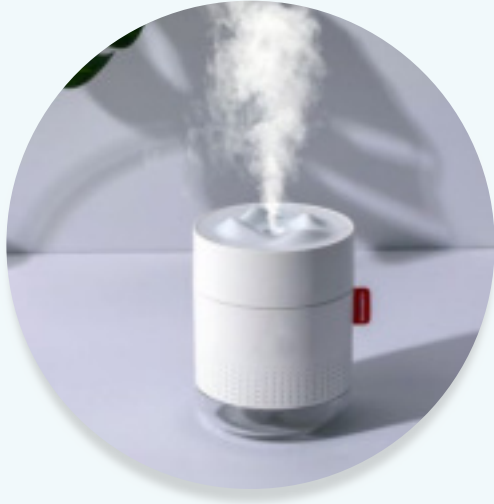
AQUAHOME 500 ML

+2 liters Aquasine misting Dilution from 25% to 50%