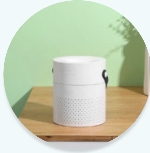
AQUAHOME 1 Litre

+2 liters Aquasine misting Dilution from 25% to 50%