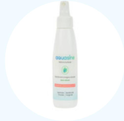
AQUASINE Hands & Surfaces